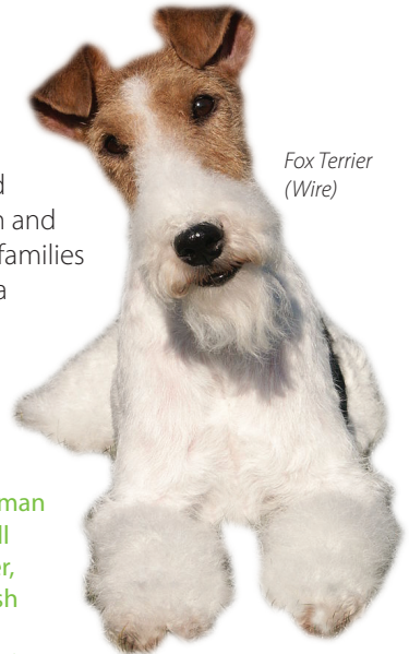
Fox Terrier (Wire)

Airedale Terrier, American Staffordshire Terrier, Australian Terrier, Bedlington Terrier, Border Terrier, Bull Terrier, Bull Terrier (Miniature), Cairn Terrier, Cesky Terrier, Dandie Dinmont Terrier, Fox Terrier (Smooth), Fox Terrier (Wire), German Hunting Terrier, Glen of Imaal Terrier, Irish Terrier, Jack Russell Terrier, Kerry Blue Terrier, Lakeland Terrier, Manchester Terrier, Norfolk Terrier, Norwich Terrier, Parson Russell Terrier, Scottish Terrier, Sealyham Terrier, Skye Terrier, Soft Coated Wheaten Terrier, Staffordshire Bull Terrier, Tenterfield Terrier, Welsh Terrier, West Highland White Terrier.